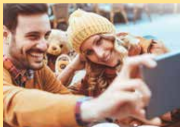
Love Stories: Pg. 4