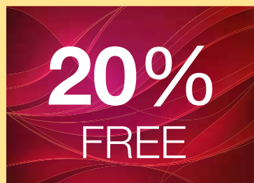
Special Offers: Pg. 6