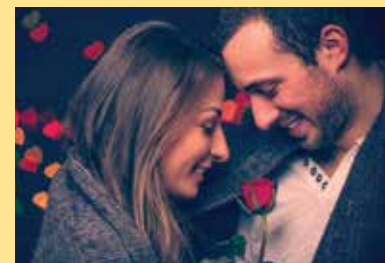
Soulmates: Pg. 7